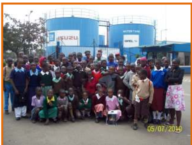
Outside the General Motors Headquarters

As part of the ongoing professional excursions, KCN children visited the General Motors headquarters as one of the planned excursions for this term. These are very inspiring occasions for them. The children who indicate their preferred occupation as being medicine and engineering got to go this time.