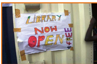
The first children's study centre in Korogocho

the children who repeatedly showed us photos and told us that it was difficult to study in their extremely small home without electricity, desks or space, and more than that, where adults are not too concerned about them.