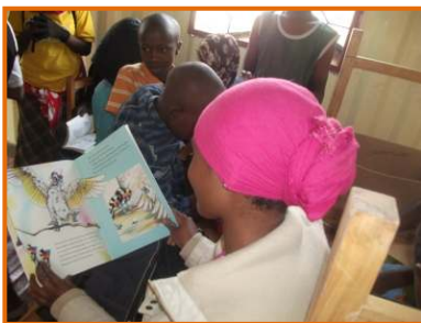
Children reading books provided by Be Kids while they take a break from painting