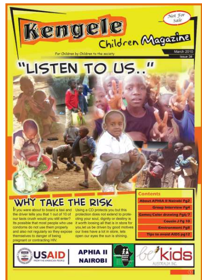
The Kengele Magazine team is progressing well and we have managed to involve APHIA, an NGO funded by USAid, and widened the readership to 17,000 copies!