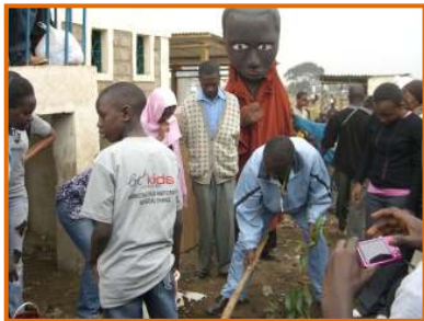
Headmaster of Shepherd's Junior College (in blue) planting a tree to show his school's support of the KCN Program

promoter to organise a tour of Fahari Africa with our children to Perth!