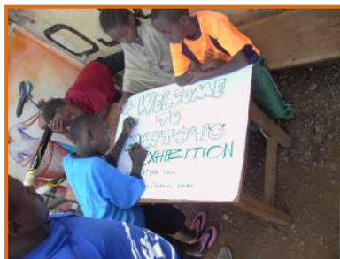
Preparing for the Artoto Exhibition in the grounds of the St John Catholic Church

these activities. It appeared that the lack of resources may have been part of the reason why the art program was languishing.