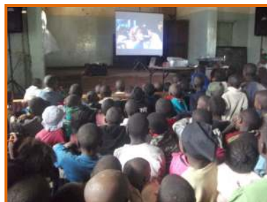
Kid's movies in Koch!!

Thanks so much to Taylor Media who donated all the equipment including surround sound, the children clapped and cheered as they watched, by request, the Original "Karate Kid".