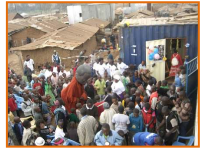
The official Opening 31 July 2010!