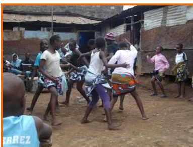
Part of our Kengele Dance troupe at rehearsals for Kengele Children's Day celebrations

On Saturday 31st July we also celebrated the Kengele Children's Day. It was a full day of celebration, singing, dancing speeches, cutting a ribbon for the new Study Centre, planting trees, all organised and conducted by the children themselves.