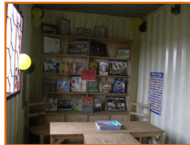
The new library