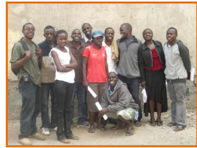
The Child Peace Facilitating team...thank you!

We also spent a day going through the Be Kids Child Policy and stressed the utmost importance of strict adherence to this policy.