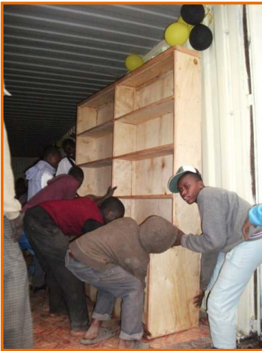
The library shelves arrive!