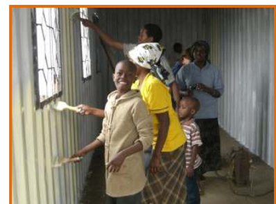
Children painting the inside of the container that is their Study Centre

their excitement – this space means so much to them!