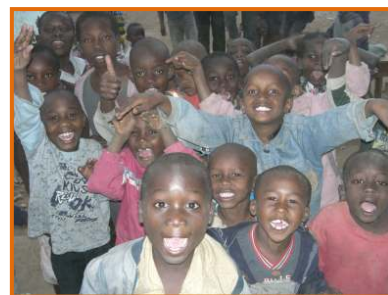
The delighted audience "After Party"! Thank you Taylor Media

Various other uses are also being planned, including the hiring of the equipment for seminars in the city to create income to pay for ancillary costs such as costumes and facilitation overheads.